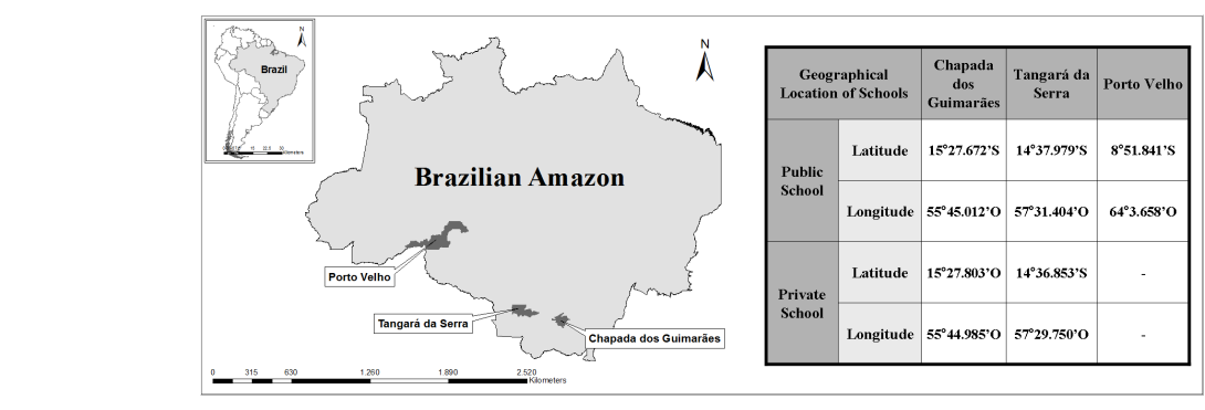
Figure 1 Geographical location of sites of study, delimiting the region of the Brazilian Amazon.

In order to reduce confounding factors, the study excluded smokers, alcoholics, patients or individuals with any genetic malformations. The influence of economic power as a confounding factor was assessed with collection of buccal cells in public and private schools when possible. Other factors such as age and gender were also evaluated. All slides were analyzed in a coded fashion by the same person.