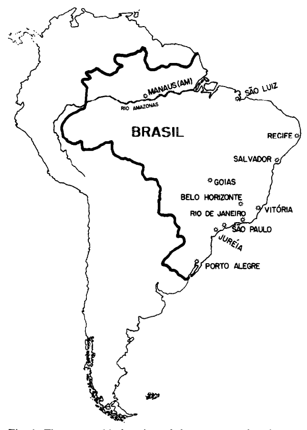
Fig. 1. The geographic location of the one natural and seven critical atmospheric aerosols selected to be sampled in the project. (For comparison, results from São Paulo, Amazonas-Forest and Goiás – Central plateau are also presented.)

The experimental methodology adopted by the project can be summarized as follows: the selected atmospheric aerosols should be sampled during 1 year by means of one SFU (stacked filter unit) sampler [2]. After 3 to 5 days of sampling the SFU containing the exposed filter is air mailed to our laboratory and is changed for an unexposed one. Besides these long term sampling an intensive short term (1 week) sampling is also performed by means of two sampling stations, each one operating with one ten-stage CI (cascade impactor), Battelle model, plus one SFU [2].